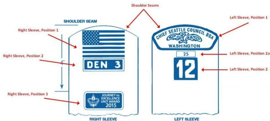
Image courtesy of Boy Scouts of America. Diagram created by Cub Scout Ideas.

Just be aware that Badge Magic can leave behind a residue if you remove / re-use the uniform with another Scout.